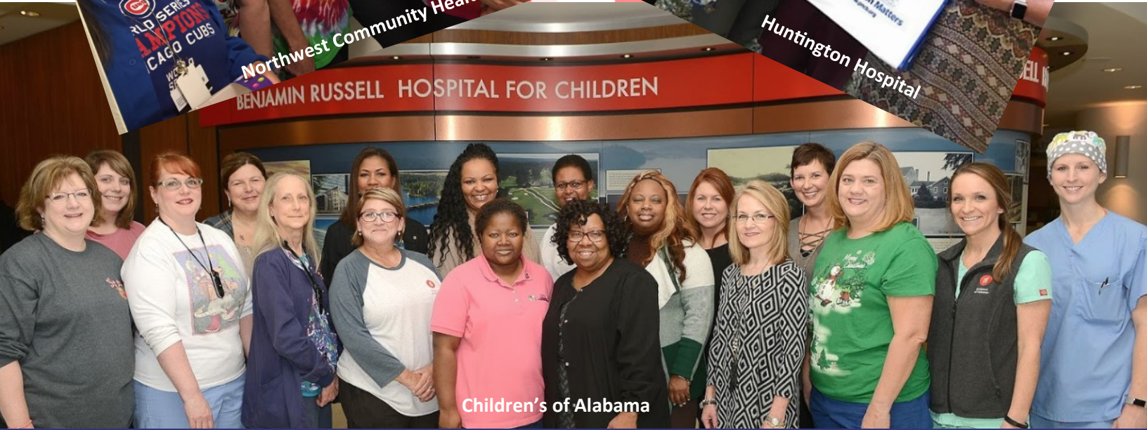
Children's of Alabama