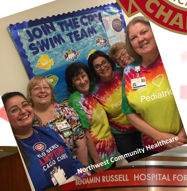
Northwest Community Healthcare