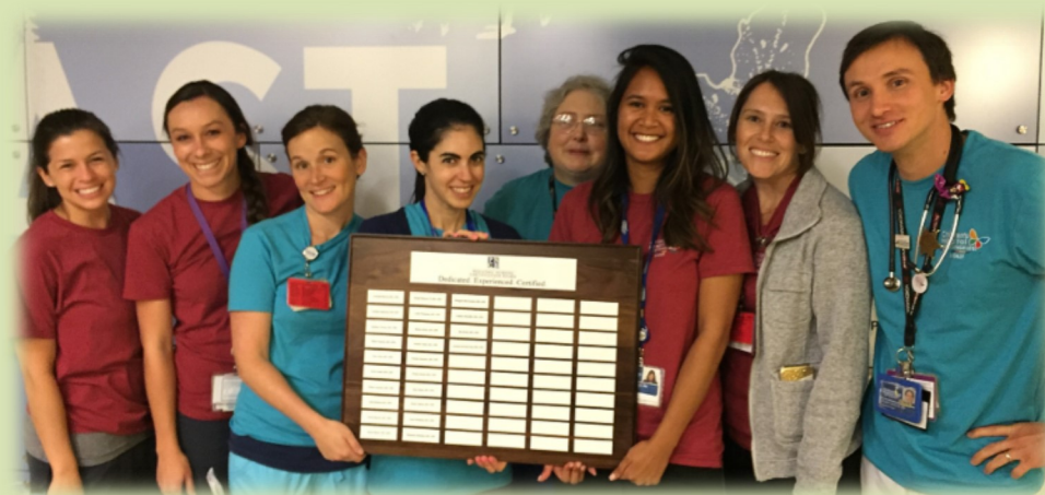
New CPNs being recognized at Children's Hospital Los Angeles

Need a Champion? Want to be one? Learn more>>